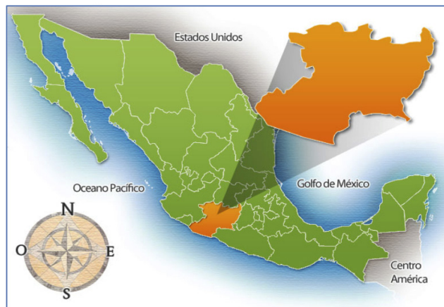
Figure 1. Location of the State of Michoacán

The State of Michoacán has historical cultural architectural heritage, natural reserves among other tangible and intangible attractions. The State has a privileged geographical location, due to its highway network that allows it to connect with the main urban centers of the country. Thus, Michoacán is located (map 1) in the western region of the country, bordering to the north with Colima, Jalisco and Guanajuato, to the northeast with Querétaro, to the east with the State of Mexico, to the south with the Balsas River that separates it from Guerrero, and to the west with the Pacific Ocean. It has a population of 4,584,471 habitants (INEGI, 2016). It is divided into 113 municipalities including its capital is the city of Morelia.