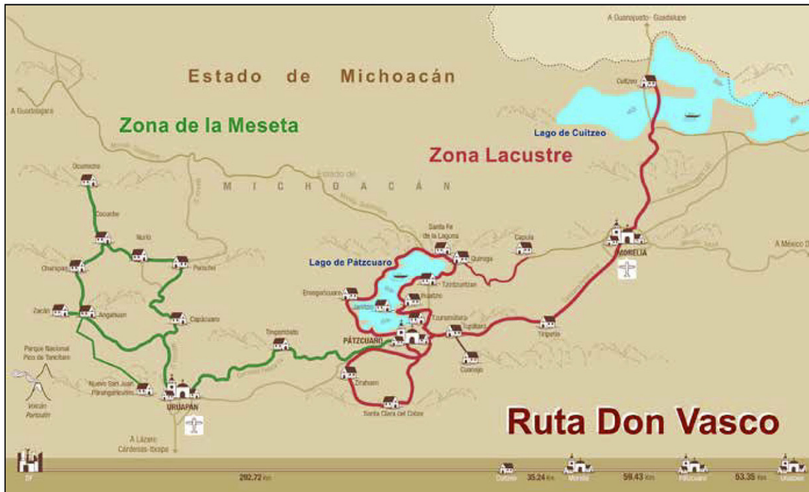
Figure 2. Territorial delimitation of the Purépecha Lake and Plateau Area on the Don Vasco Route