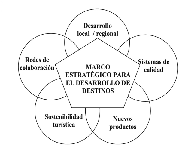
Figure 1. Strategic framework for integral planning of tourist destinations

This focus on the local community reveals the tight relationship between sustainable tourism and territorial tourism. In turn, this relationship exposes the need for the sustainable tourism policy of a territory to be included into its development plan, so that it is measured by social, cultural and environmental progress of its communities (Ávila & Barrado, 2005). Ávila & Barrado (2005) picture sustainable tourism integrated into territorial development, for whose planning it is necessary to consider multiple factors such as life quality, productive structure, the degree of associativity, the installation of decision making and management formulas that are somewhat agreed upon and the nature of other economic sectors. These issues are summarized in their strategic framework for integral planning of tourist destinations, illustrated below.