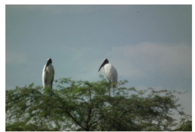
Mycteria americana