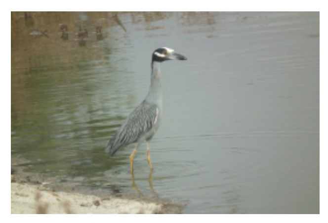
Nyctanassa violacea