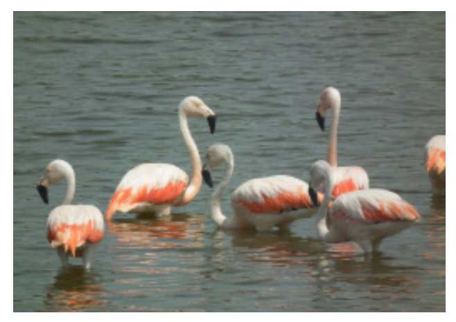
Phoenicopterus chilensis