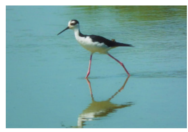
Himantopus mexicanus