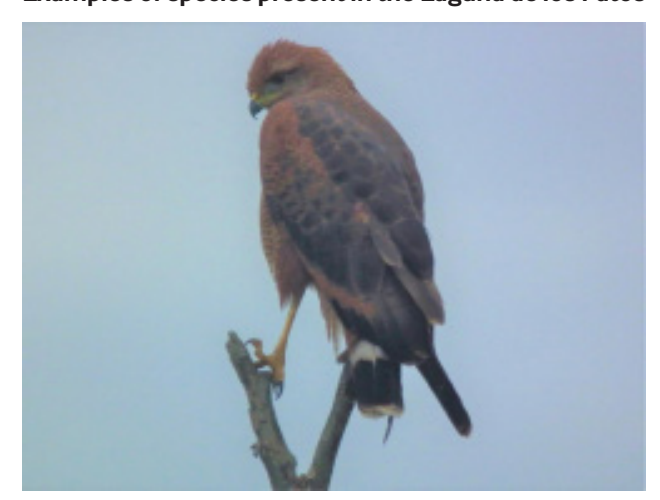
Buteogallus meridionalis