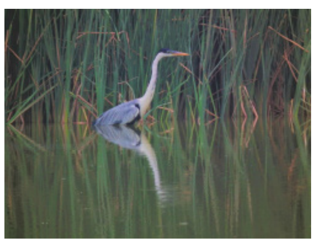
Ardea cocoi