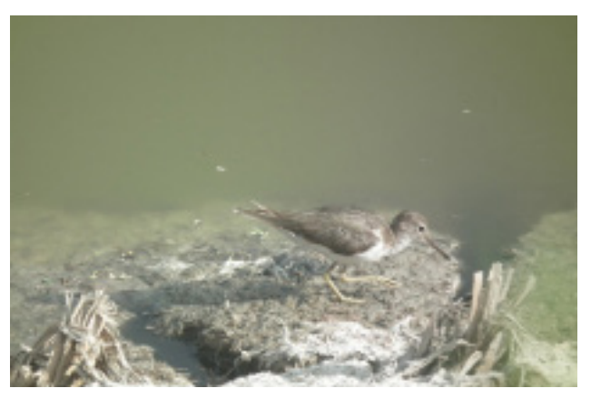
Actitis macularius