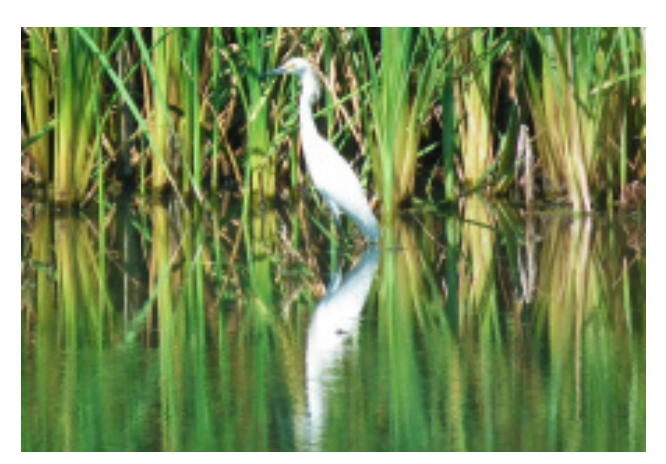
Egretta thula