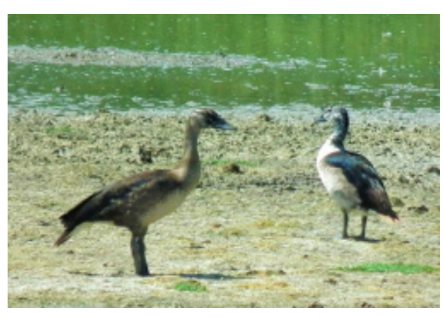
Sarkidiornis sylvicola