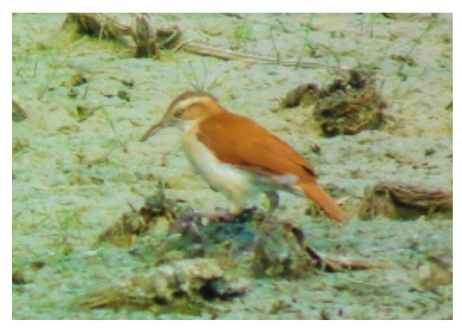
Furnarius leucopus