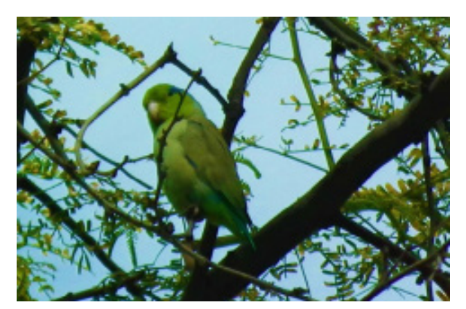
Forpus coelestis